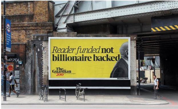
A 48 sheet is roughly 6m wide x 3m high, made of 12 printed panels